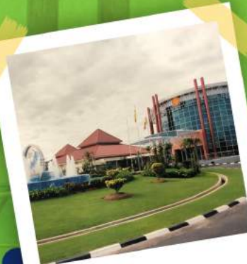
OGDC back in 2002

OGDC is a family-oriented centre where visitors can expand and explore more than 100 interactive exhibits which covers the learning of science, engineering and technology education in the development of the oil and gas industry. Range of activities for different age groups including technology workshops, science camps, science show competitions, school visit, outreach activities and much more science-related activities were made available for our visitors.