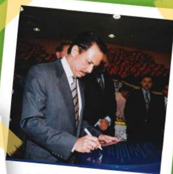
14 September 2002, OGDC official launch by His Majesty