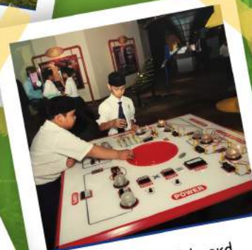
Giant Circuit board